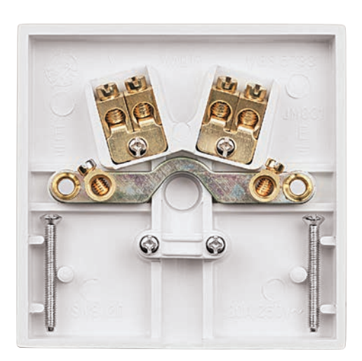
PRW017 - Rear View